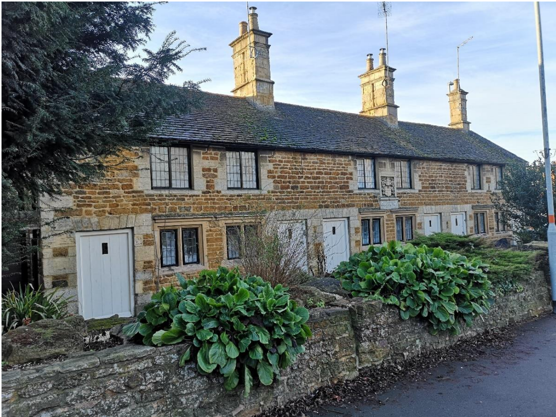
Sawyer's Almshouses, Sheep Street, Kettering